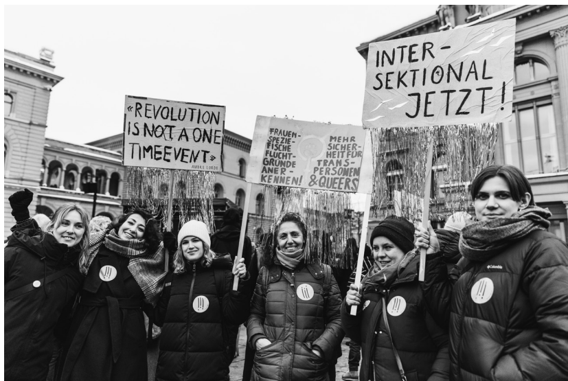
Part of the team at the national demonstration against violence in Bern.

Since its creation in 2024, the coordination circle has turned out to be an important interface between the three circles. By revising processes and updating regulations it is now helping to reduce the workload of the overall team.